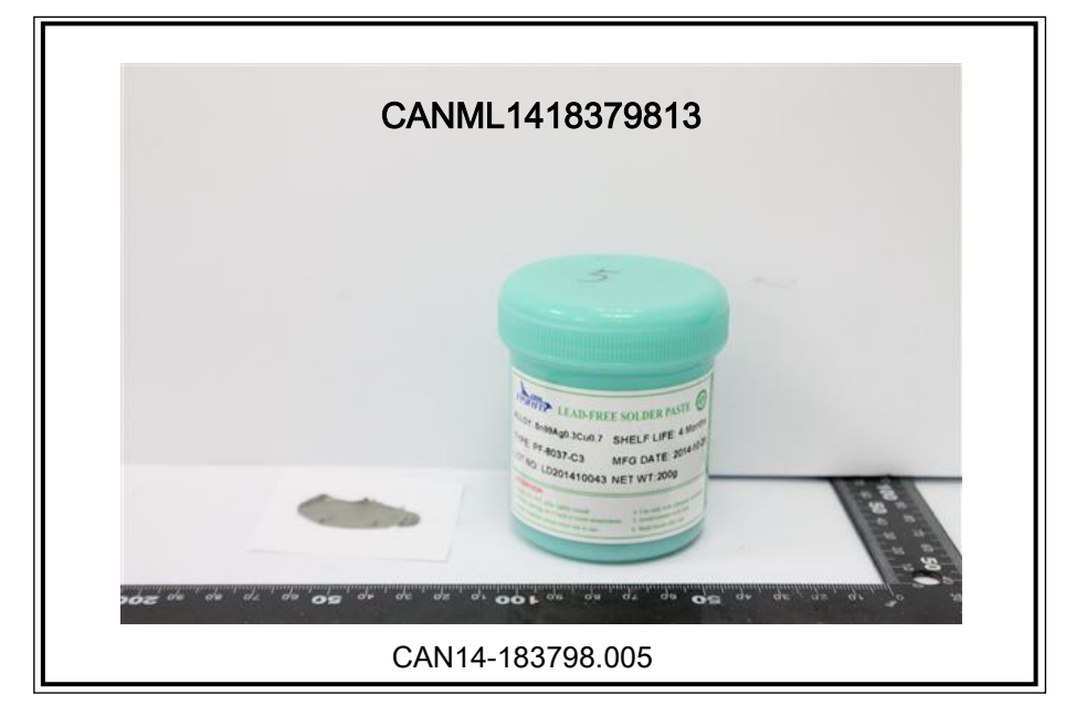
SGS authenticate the photo on original report only